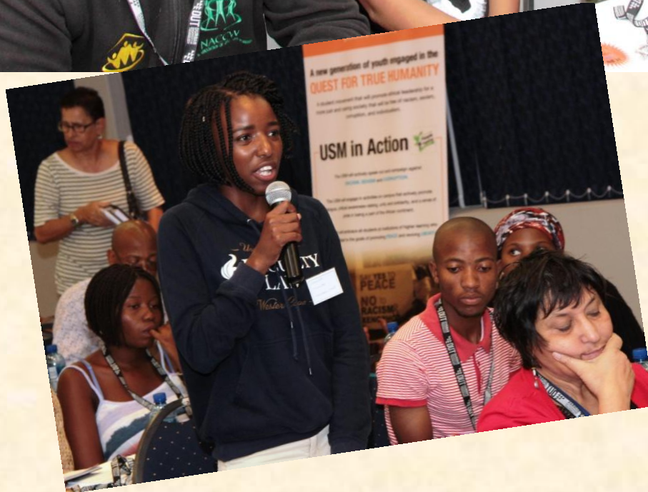
Participants at the symposium